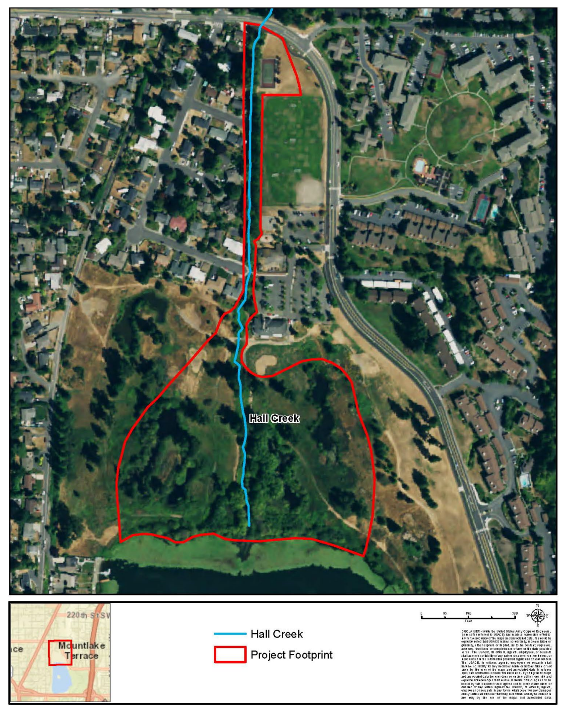
Figure 2 Project Location

Problem Statement: This CAP Section 206 Ecosystem Restoration Project identifies and evaluates alternatives for restoring degraded ecosystem structures, functions and processes in Ballinger Park, Mountlake Terrace, Washington. The U.S. Army Corps of Engineers (USACE) is undertaking this action in partnership with the City of Mountlake Terrace. The primary concern this study addresses is ecosystem degradation in Lake Ballinger Park. Alteration of the environment and encroachment on the floodplain by human-made structures have degraded and continue to affect natural ecosystem